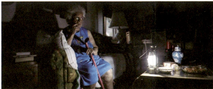
Check on your neighbours, especially the elderly, those with young children and others with health concerns.

• Keep your car's gas tank more than half full